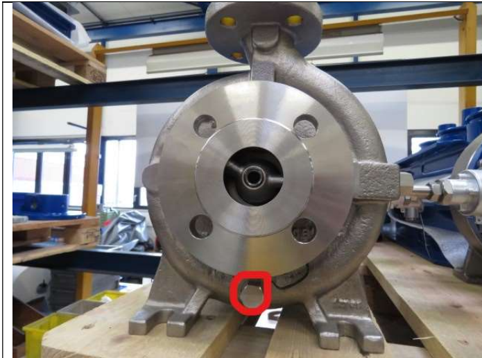
Drain plug with MKP: Normal situation, mounted.