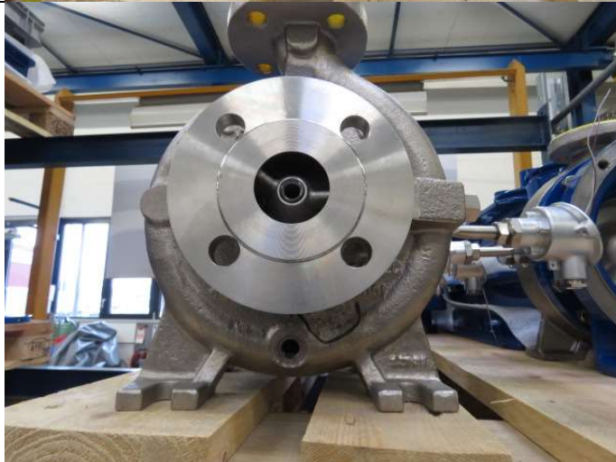
Drain plug with MKP: removed.