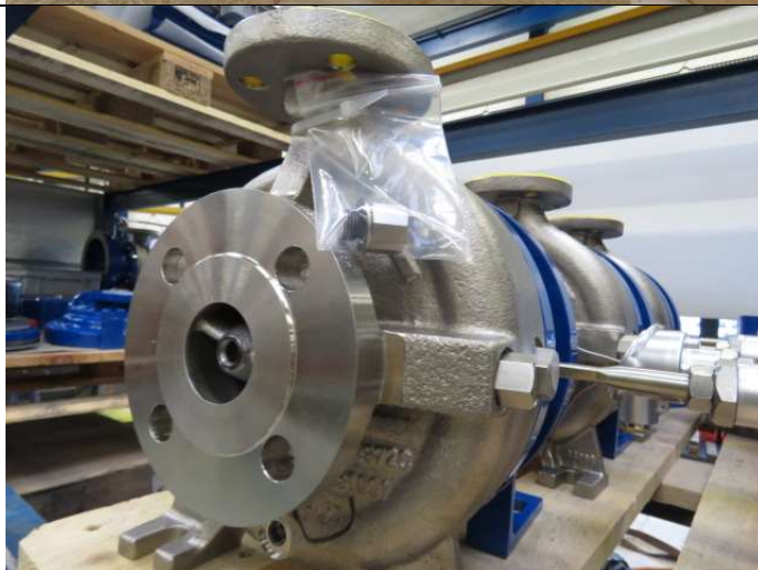
Drain plug with MKP: supplied attached loose to pump.